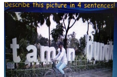
Figure 6 Describing public place in 4 sentences

views and viewing mistakes as a chance to learn. The teaching material of describing places in 4 sentences could be observed in the following figure.