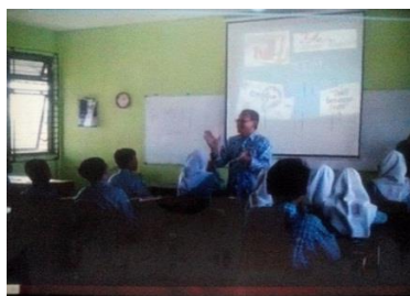
Figure 4 Energizing students by singing and various clapping hands

There were 9 activities done by the observed teacher during the third lesson. In the pre-activity, the teacher stood in front of the students and greeted the students by saying “Assalamu’alaikum”, “Are you fine today?” at the beginning of the lesson. It was very clear that this practice was not a creative one. On the next action, the teacher motivated the students by singing the song “If you are happy and you know it” together. This implementation belonged to the creative one as it functioned to prepare the students’ psychological condition before going to the main material. This action was suitable for the second indicator of creative teaching, creating new and meaningful ideas. The teacher continued energizing the students by saying “Clap your hands”, “Stop”, “Single clap”, “Double claps”, “Triple claps.” The students directly follow the teacher’s command. Since the teacher linked new ideas to others effectively, the teacher has done the fourth aspect of creative teaching. In addition, clapping hands in various ways meant that the teacher showed originality in work and it belonged to indicator 6. The situation of the teaching implementation was shown in the following figure.